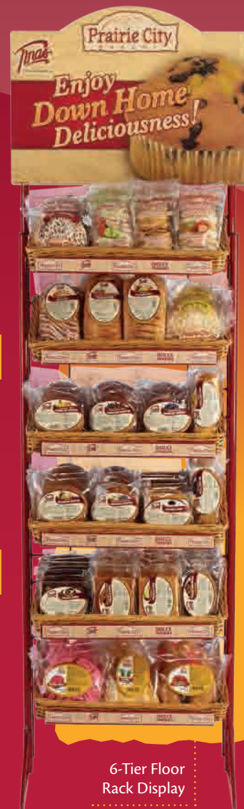
6-Tier Floor Rack Display