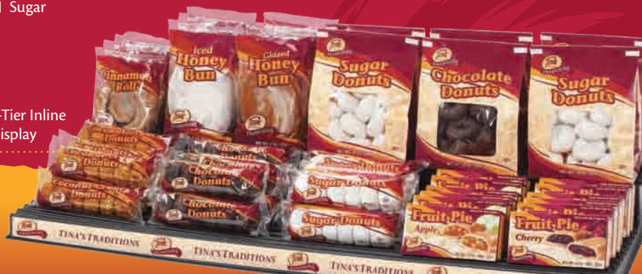
2-Tier Inline Display