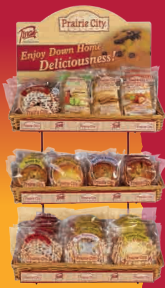
3-Tier Counter Rack Display

Prairie City Bakery 100 Fairway Drive #138, Vernon Hills, IL 60061 For more information, contact us at 1-800-338-5122 www.pcbakery.com